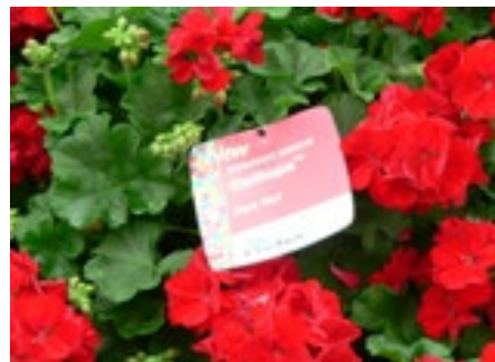
Calliope Dark Red Geranium

For Florida growers there will be trials at the University of Florida in which Harmony New Guinea Impatiens will be compared with Syngenta's Super Sonics.