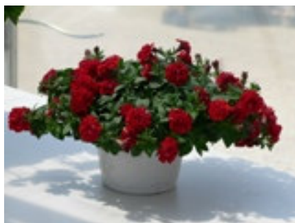
Wave Double Red

and a bluish-purple leaf margin. 'Hilo Bay' had large glossy, olive-green leaves that are ruffled in texture. We spoke with Dr. Cho at the Plant Haven display and were told of some very exciting new Colocasias for future release; totally unique from the current offerings.