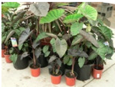
Royal Hawaiian Colocasia