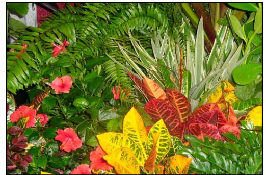
Tropicals featured in Gray's Ornamental's booth