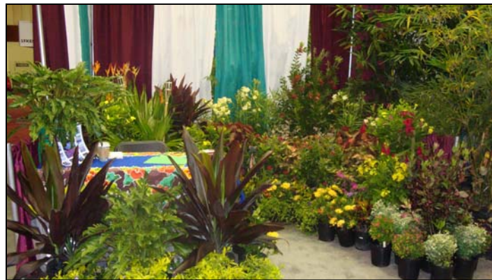
Middle: Nelson's Wholesale Nursery booth