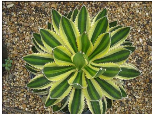
Agave 'Quadricolor' from our Indian supplier at Perino's Garden Center

Just click on the catalogs above to open them. If you would like to receive our catalogs in print please let us know and we would be happy to send them to you.