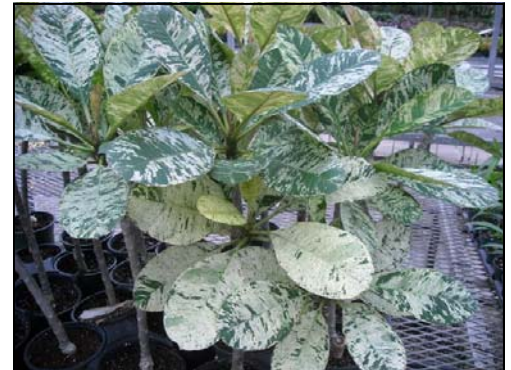
Variegated Plumeria from our Thailand supplier at Perino's Garden Center