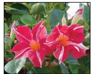
Stars and Stripes™