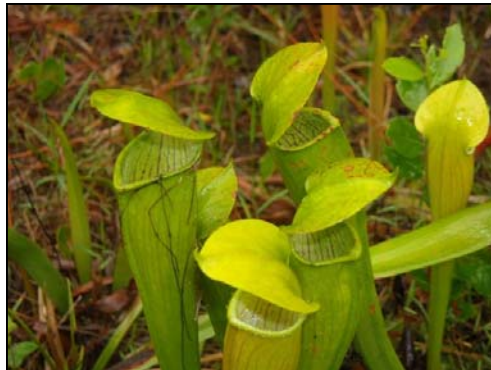
Carnivorous plants located at one of our customers, Murray's Nursery