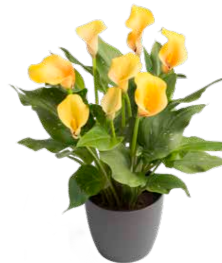
JACK O LANTERN