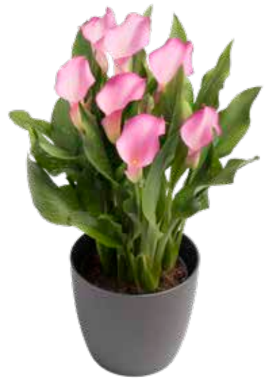
TOP PICK PETER'S PRIDE