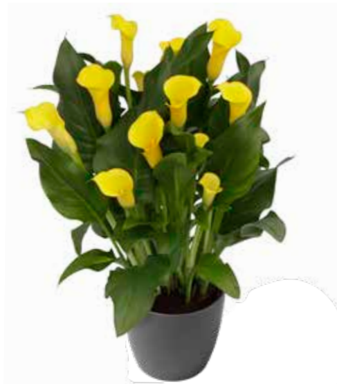
TOP PICK CORAZON