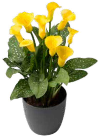
TOP PICK GOLD CROWN