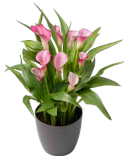
TOP PICK GARNET GLOW