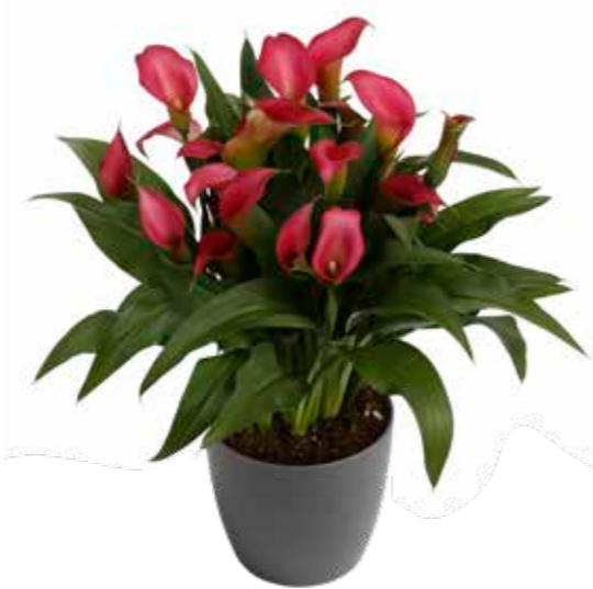
TOP PICK WILD SALMON