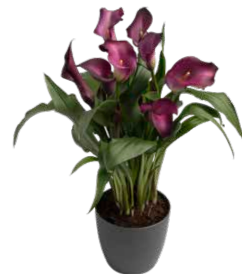
TOP PICK NIGHT LIFE