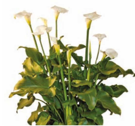
TOP PICK DIVA CLASSICA

Planted in September through January. Calla Aethiopica DIVAS™ series blooms continuously through spring and early summer. Excellent pot plant, garden plant, cut flower and around ponds. Naturalizing bulbs as long as soil does not freeze.