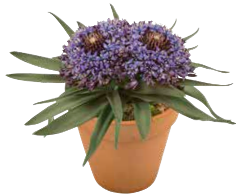
TOP PICK BONAIRE