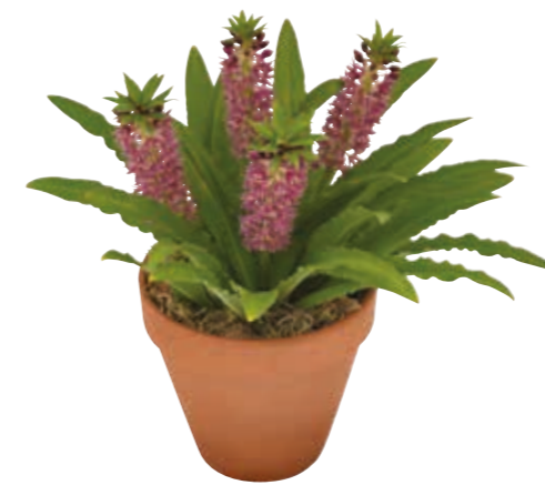
TOP PICK LEIA