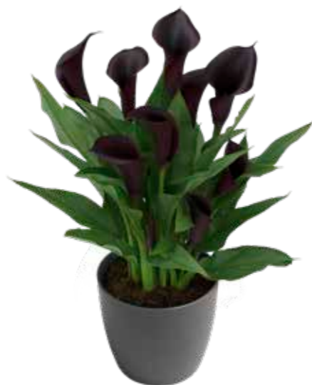
TOP PICK ODESSA