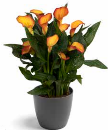
TOP PICK MORNING SUN