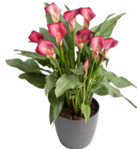
TOP PICK PINK PUPPY