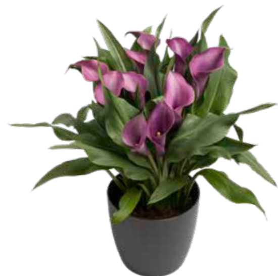
TOP PICK GRAPE VELVET