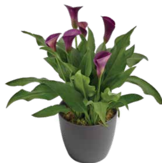
TOP PICK RIO