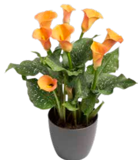
TOP PICK BEATRIX