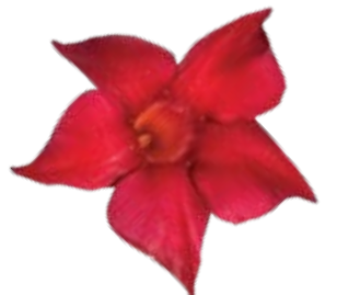
Dark Red Beautiful rich red that is deeper in color than Crimson.