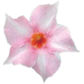
Cream Pink Excellent choice for lighter color schemes. A European favorite to use in combinations