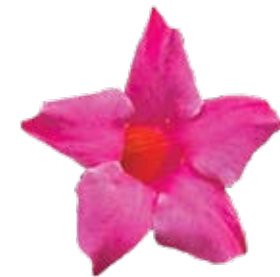
Pink Classic, rich dark pink adds tropical punch. Think of it as lipstick for your landscapes.

The original Sun Parasols have the widest color range, including the first stable dark red and crimson, shades of pink, white and novelties. Plants are natural climbers and suitable for patio containers, hanging baskets, balconies, bedding and even as a house plant.