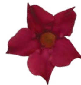
Burgundy Truly unique, a chic royal purple. Cooler regions are better to maintain the color.