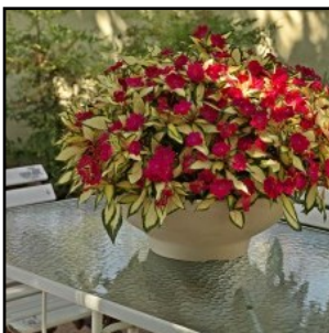
Tropical Rose (V/L)