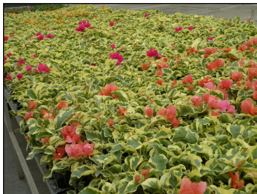
Variegated Bougainvillea liners