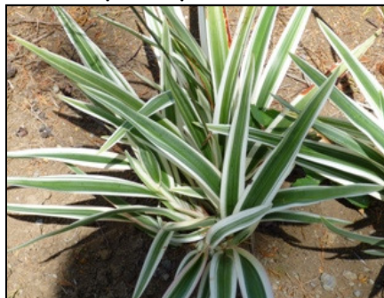
Dianella 'White Variegated'