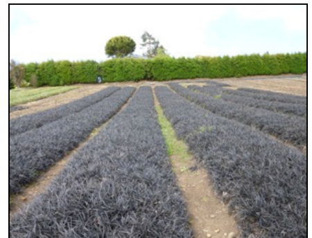
Black Mondo Grass fields