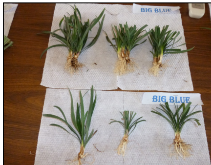
Liriope Clumps and Bibs