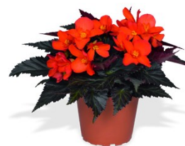
Begonia Unstoppable 'Fire'