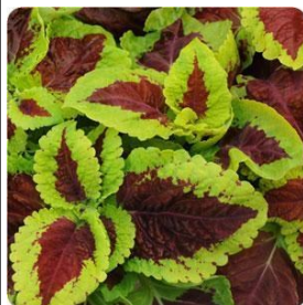
Coleus Emotions 'Inspired'