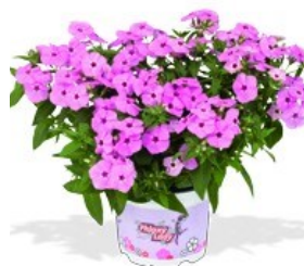
Phlox Phloxy Lady 'Pink'