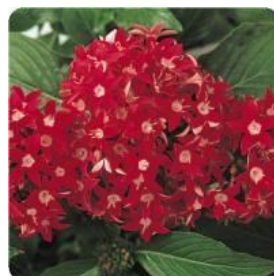
Pentas Butterfly 'Red'