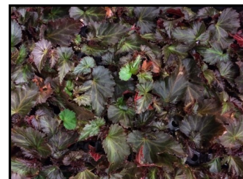
Begonia Unstoppable Upright Fire Available per variety: 50cp