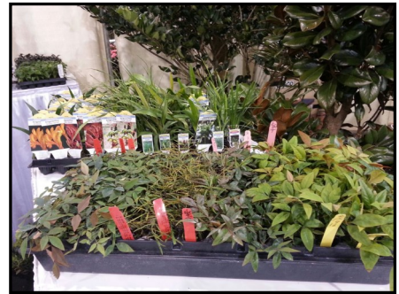
Mixed trays of Nandinas; Availability per variety 72cp