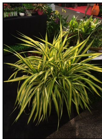
Pandanus compactus variegata Available as Bare Root Division