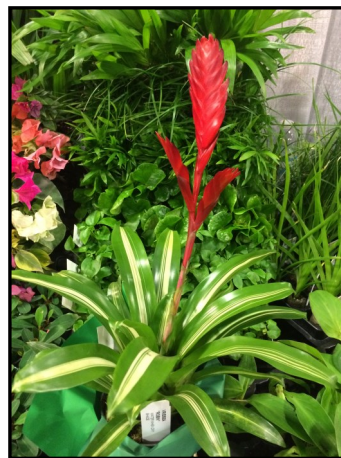
Vriesea 'Robin' Available as URC