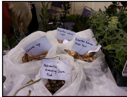
Assorted bulbs from Thailand