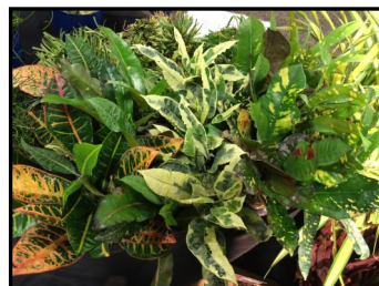
Assorted Crotons Available per variety: 50cp

Just click on the catalogs above to view them directly from your computer!