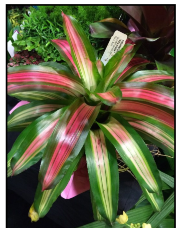
Neoregelia 'Raphael' Available as URC