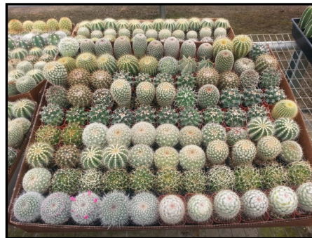
Assorted Cactus Available in 2inch