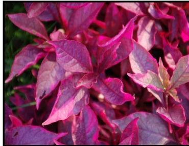
Alternanthera 'Brazilian Red Hots' Available as URC and RC

Websites such as Pinterest are a great start to get ideas on what you can create for your customers.