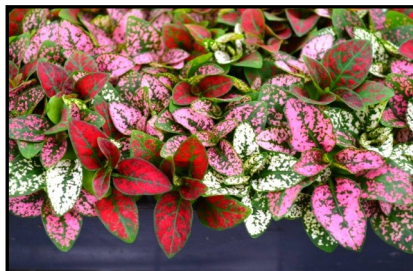
Hypoestes Splash Select Available as RC; Pink, White, Rose and Mix