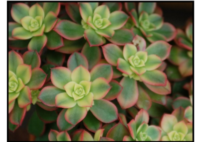
Aeonium 'Kiwi' Available as URC and RC