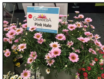
Argyanthemum Grandessa 'Pink Halo' from Suntory