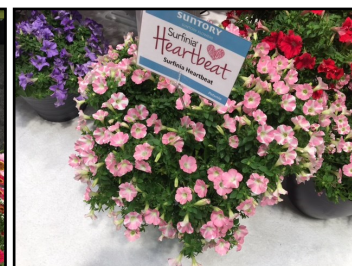
Petunia Sufrinia 'Heartbeat' from Suntory

This was a great Cultivate '17! We love checking out the new plants, as well as meeting with our vendors and customers.