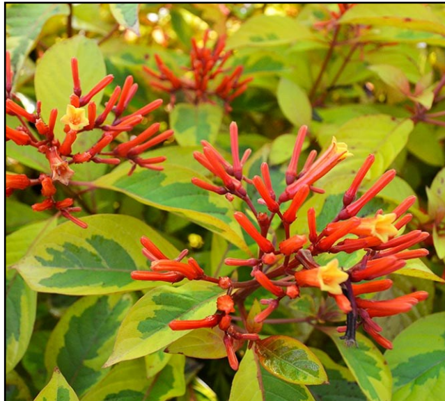
Hamelia Lime Sizzler™ Firebush pp26247

The Lime Sizzler™ Firebush has green and yellow variegated foliage with red-orange flowers from late Spring through Fall. It performs well in the landscape or in a container.