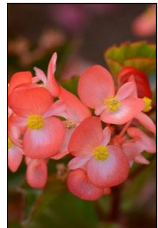
Begonia Babywing® Bicolor