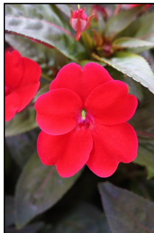
New Guinea Impatiens SunStanding Dark Red **NEW**