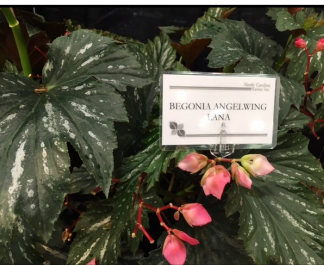
Begonia AngelWing 'Lana' from North Carolina Farms