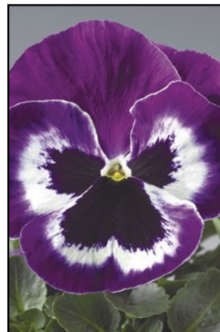
Pansy Delta Premium Violet & White