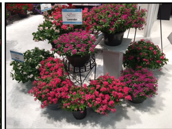
Cathranthus (Vinca) Soiree from Suntory