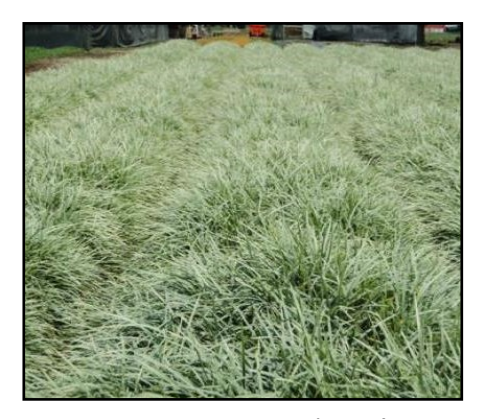
Liriope Variegated 'Aztec' Bib $.166 1400/case Clump-cut $.443 500/case