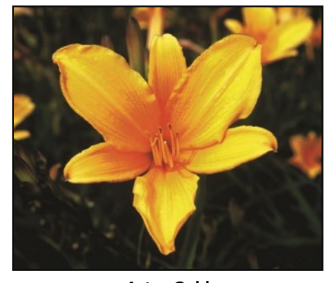
Aztec Gold Bib $.318 500/case