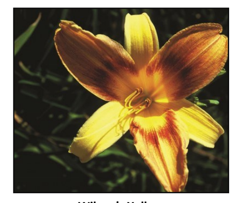
Wilson's Yellow Bib $.429 400/case