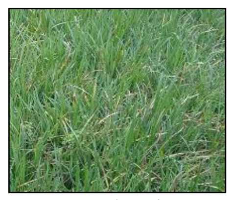
Liriope 'Spicata' Bib $.13 2000/case Clump-cut $.393 500/case