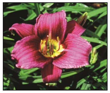
Barbary Corsair Bib $.429 400/case