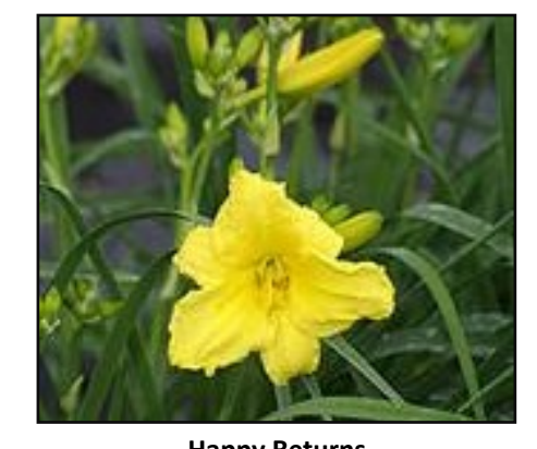
Happy Returns Bib $.293 500/case Clump $.443 500/case