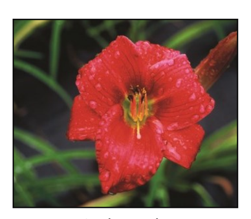
Cranberry Baby Bib $.429 400/case