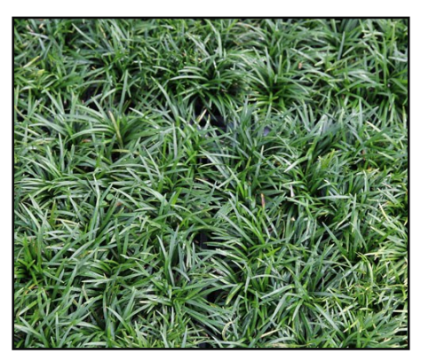
Ophiopogon japonicas nana Bib $.106 4000/case