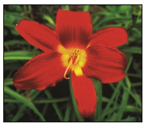
Ming Toy Bib $.329 400/case