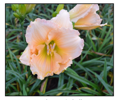
Barbara Mitchell Bib $.429 400/case