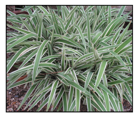
Dianella tasmanica variegata B/R $.279 400/case