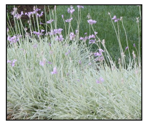
Society Garlic 'Variegated' Bib $.221 1000/case