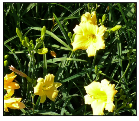
Stella Bella Bib $.429 400/case