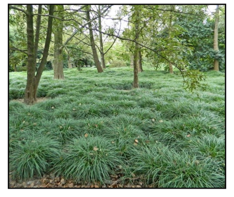
Ophiopogon japonicus Bib $.083 3000/case