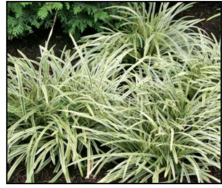
Liriope 'Silvery Sunproof' Bib $.359 1000/case