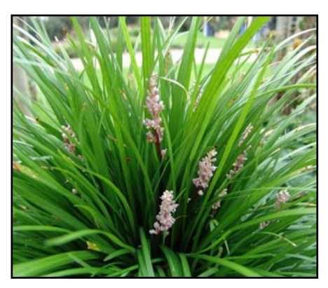
Liriope 'Isabella'® Mini Clump $.605 500/case Singles $.249 2000/case Comes with tags