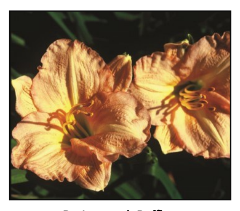
Bib $.418 500/case