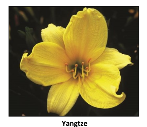
Bib $.318 500/case