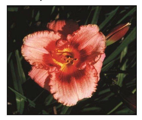
Strawberry Candy Bib $.866 400/case