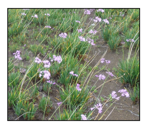
Society Garlic 'Green' Bib $.196 1000/case