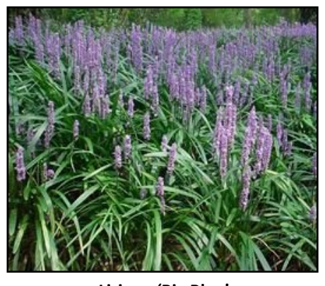
Liriope 'Big Blue' Bib $.141 1400/case Clump-cut $.393 500/case