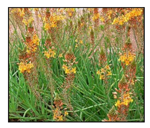
Bulbine frutescens B/R $.121 1000/case