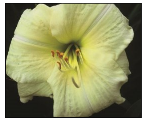
Joan Senior Bib $.605 500/case