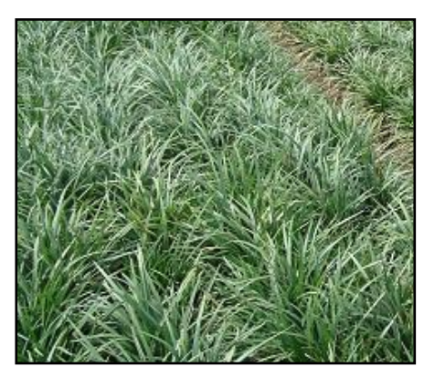
Liriope 'Super Blue' Bib $.221 1000/case Clump-cut $.468 500/case