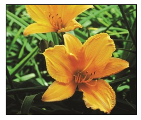
Aztec Evergreen Bib $.418 500/case