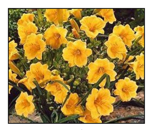
Stella D' Oro Bib $.293 500/case Clump $.443 500/case