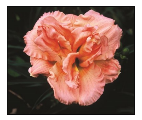
Siloam Double Classic Bib $.866 400/case