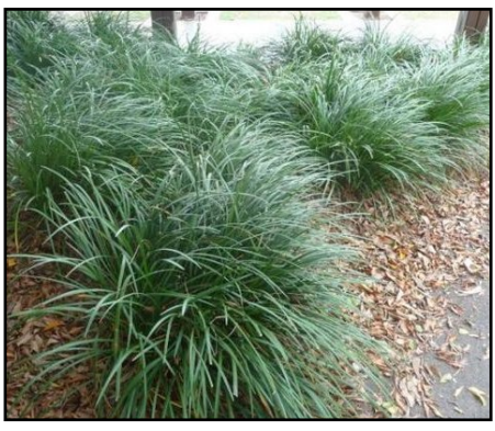
Liriope 'Evergreen Giant' Bib $.253 800/case