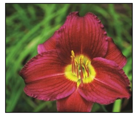
Little Wart Bib $.491 400/case