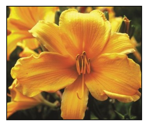
Gertrude Condon Bib $.616 400/case