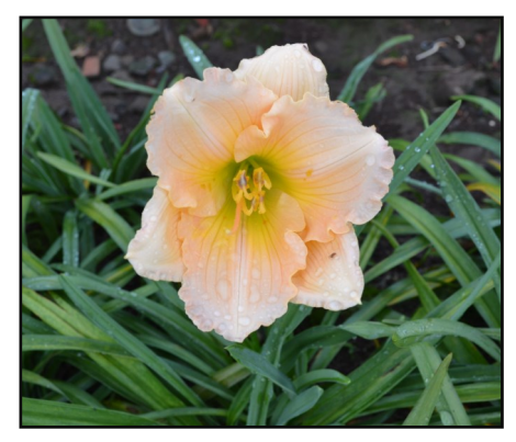
Fairy Tale Bib $.492 400/case